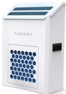
PURADIGM PRO (Large Facilities)