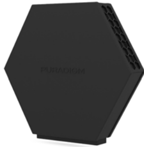
PURADIGM Grow (Small Facilities)

PURADIGM Technology has been developed to address many of the challenges of indoor growing facilities. Our objective is to assist in the management of mold, mildew and other potentially dangerous pathogens in the air, on surfaces and on the seedlings, flowers and plants.