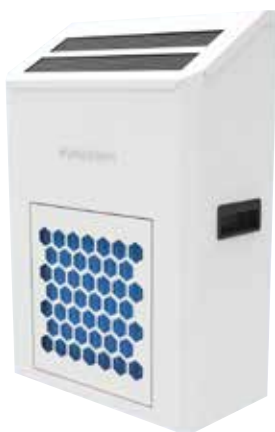
PURADIGM Pro (Industrial Strength)

PURADIGM Technology works as a active purification system that delivers high energy clusters and advanced oxidation throughout the indoor space. Puradigm takes the solution to the problems by providing 24/7 support for growers and management teams.