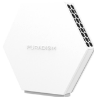
PURADIGM Grow (Wall Mounted)

Contact a Puradigm Pro about our facility assessment program. Or discover us online at www.puradigmsolutions.com